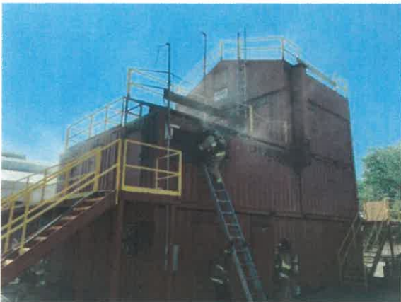
Firefighter making access for victim search and rescue.